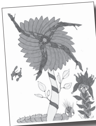
Pam's whimsical card creations.

"Being in The Card Project makes you feel more competent," she continues. "When you are homeless, you can forget what it is that you can do. You can forget who you were before."