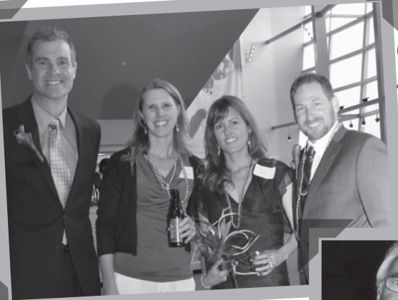
Representatives from Turner Construction. The company was also honored for their commitment and service to The Gathering Place.