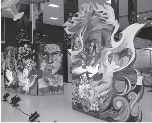
Repainting the Future Mural Project.