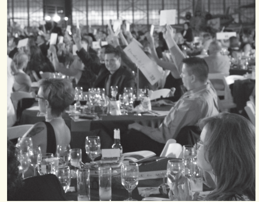
A lively auction.

More than 400 friends of The Gathering Place came together on September 25 to support our work at the 2015 Annual Gala. Held at Wings Over the Rockies Air & Space Museum , the event raised $135,000 to help fund the programs and services we offer.