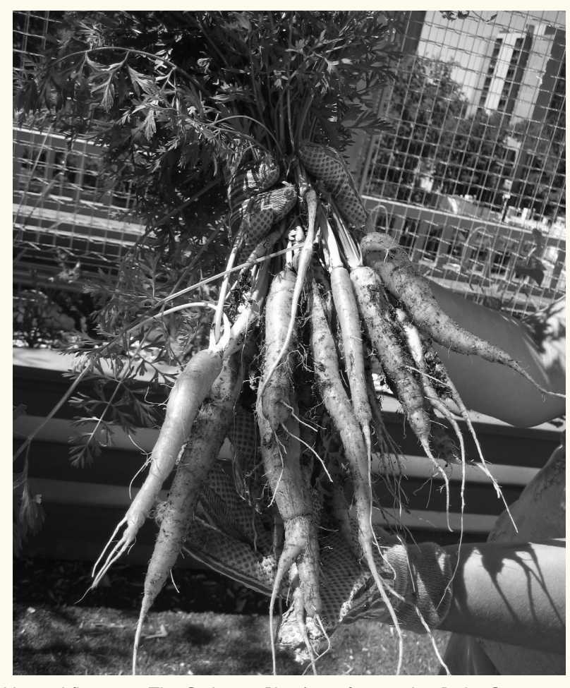
Pictured above, starting at the top left corner: A planter full of vegetables and flowers in The Gathering Place's rooftop garden. Right: Carrots grown in the rooftop garden. Bottom left: Table grapes climbing the greenscreen® in the rooftop garden.

With breathtaking views of the Rocky Mountains and numerous planters filled with vegetables, herbs, and fruit, the rooftop at The Gathering Place is a welcome escape from the hum of activity inside the building. Members are invited to participate in a seasonal gardening program, helping to plant, nurture, and harvest produce from the rooftop garden that is used for meals served on site or distributed through Betsy's Cupboard. In 2011, over 90 pounds of produce were harvested from the rooftop garden. This year's crops have included lettuce, carrots, beets, tomatoes, beans, grapes, cherries, and basil.